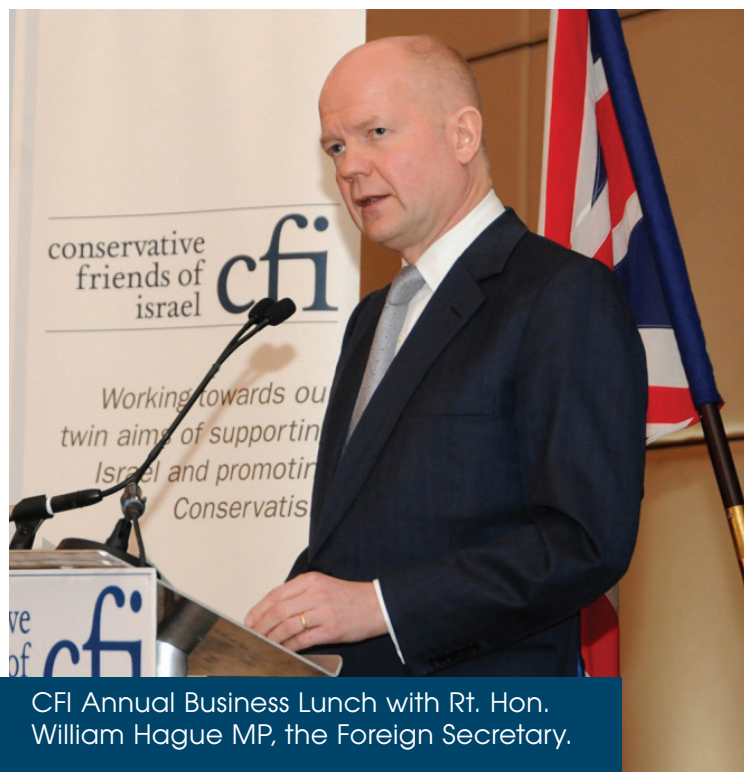
CFI Annual Business Lunch with Rt. Hon. William Hague MP, the Foreign Secretary.