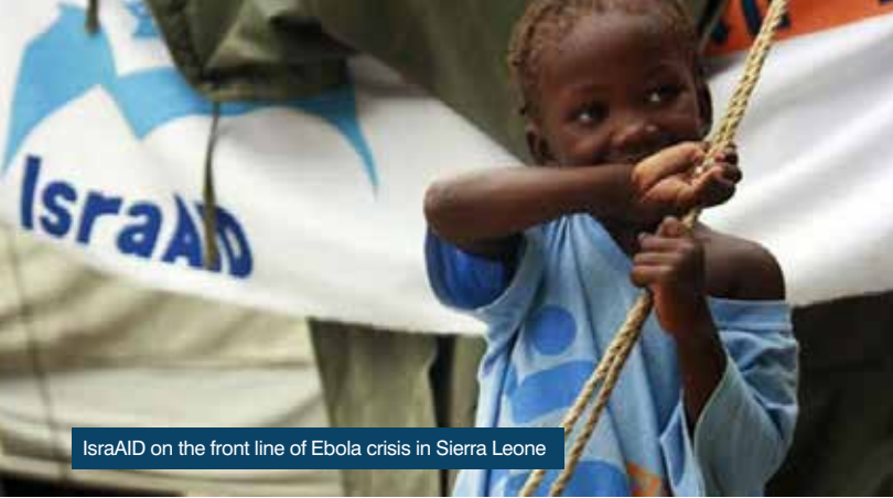
IsraAID on the front line of Ebola crisis in Sierra Leone