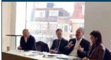
CFI breakout session at We Believe in Israel 2015