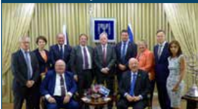
CFI Delegation with Israel's President Reuven Rivlin