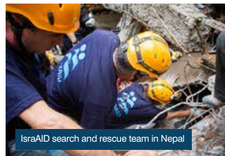
IsraAID search and rescue team in Nepal

Since its inception, the State of Israel has stood proudly as a beacon of humanitarian endeavours. Driven by a profound and genuine humanitarian conscience, Israel's international aid programmes have benefited millions across the world and we at IsraAID are proud of the part that we play in this important task.