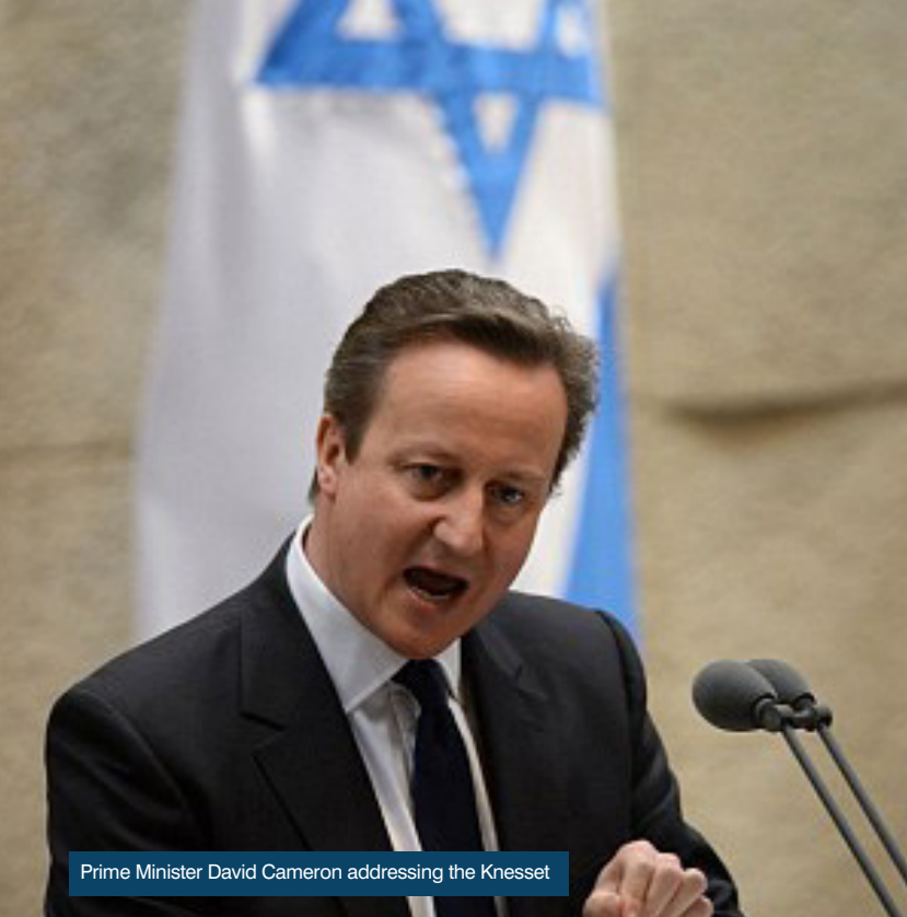
Prime Minister David Cameron addressing the Knesset