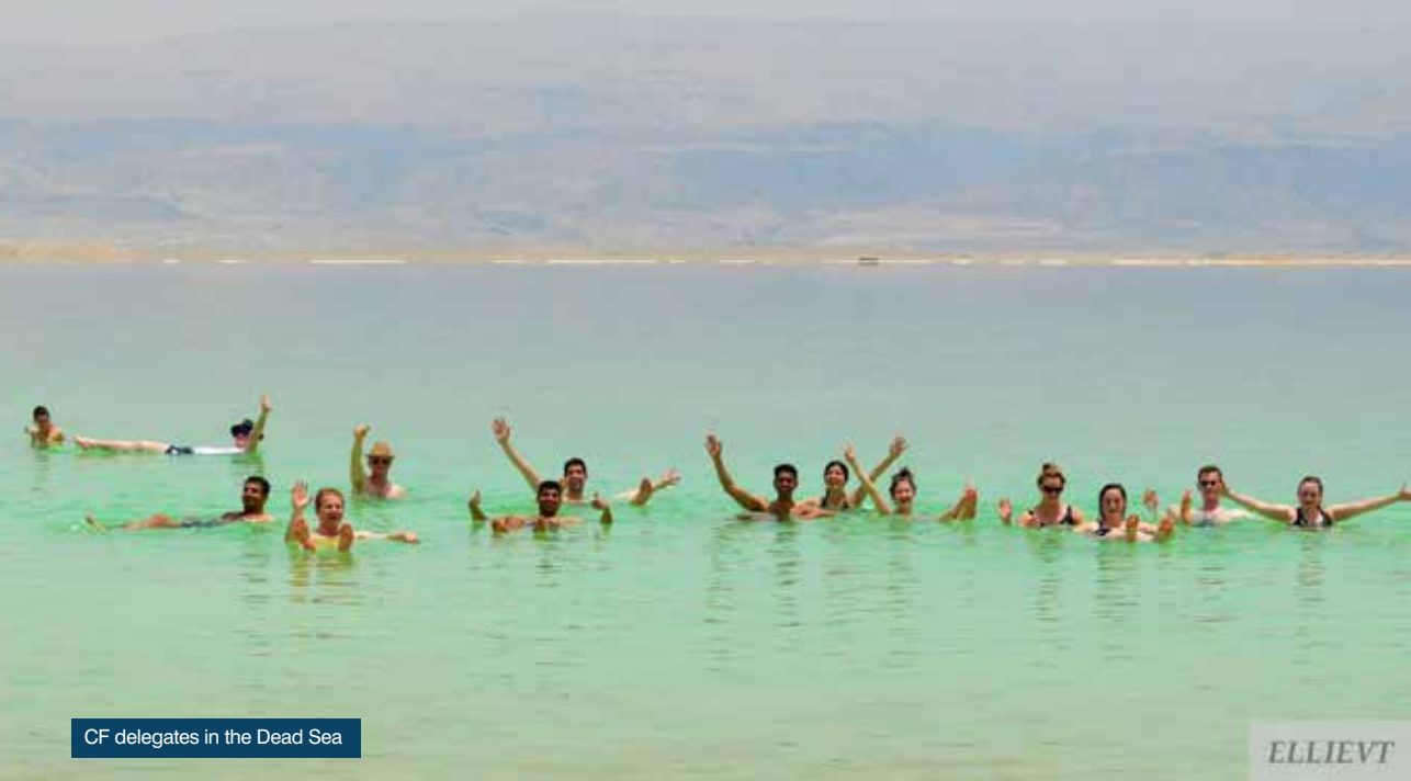
CF delegates in the Dead Sea