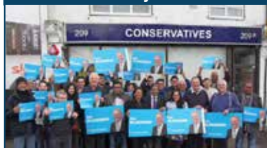
CFI activists campaigning with Bob Blackman MP