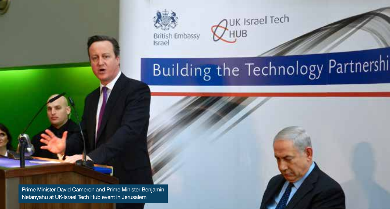
Prime Minister David Cameron and Prime Minister Benjamin Netanyahu at UK-Israel Tech Hub event in Jerusalem