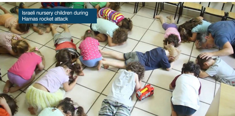
Israeli nursery children during Hamas rocket attack

The impact of the constant barrage of Hamas rockets on children is far deeper than meets the eye. It is heartbreaking to learn of such realities which children face under these unique circumstances.