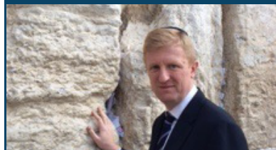
Oliver Dowden MP at the Western Wall