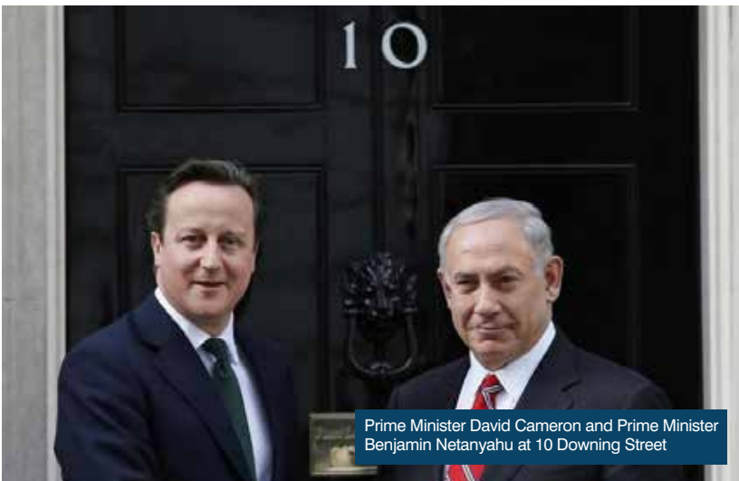
Prime Minister David Cameron and Prime Minister Benjamin Netanyahu at 10 Downing Street

In the last Parliament, CFI took over 90 Conservatives, from across the Party, on delegations to Israel and the Palestinian Territories, a testament to the commitment shown by the Party to understanding the complexities of the region.