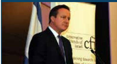
Prime Minister David Cameron addresses CFI Annual Business Lunch