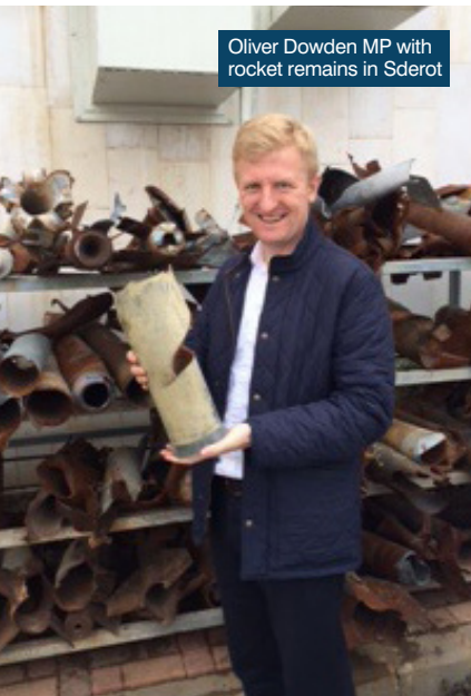
Oliver Dowden MP with rocket remains in Sderot

“Nothing beats the experience of seeing the situation on the ground.”