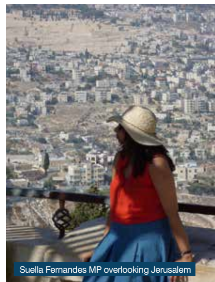
Suella Fernandes MP overlooking Jerusalem

I have returned to the UK reflecting on the causes, effects, and complexities of an issue which has defined generations of politicians. I'm grateful to CFI for its professionalism, balance, and comprehensiveness in contributing to a peaceful and lasting solution through education and openness.