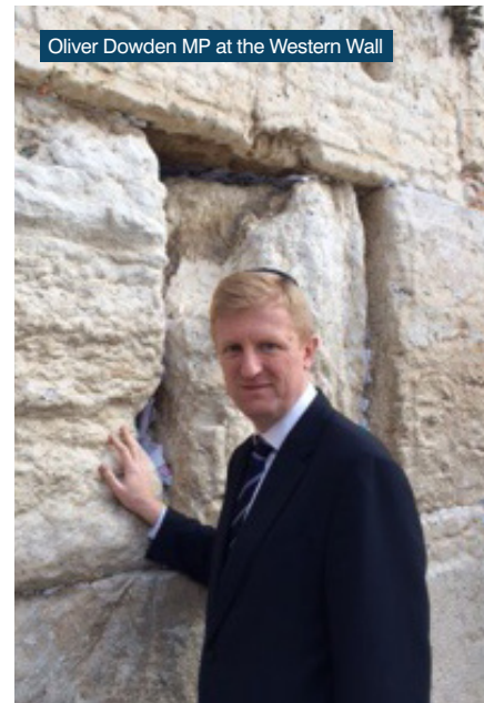
Oliver Dowden MP at the Western Wall