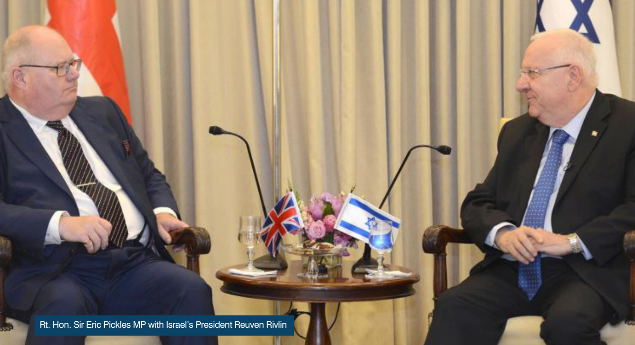
Rt. Hon. Sir Eric Pickles MP with Israel's President Reuven Rivlin