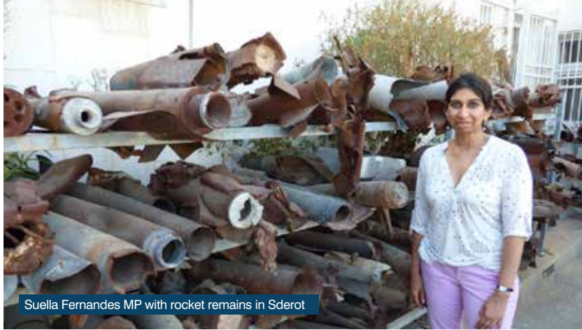
Suella Fernandes MP with rocket remains in Sderot

For a country faced with so many existential threats, defence and security were recurring themes. Discussing the construction of the security barrier around the West Bank with Col. Dany Tirza was particularly absorbing as he described the realities of countless suicide bombings against civilians in Jerusalem and right across Israel during the Second Intifada. The security barrier continues to play a key role in thwarting terrorism, with 80 attempted suicide bombings prevented in 2014 alone.