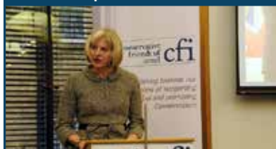
Home Secretary Theresa May addresses CFI Annual Parliamentary Reception