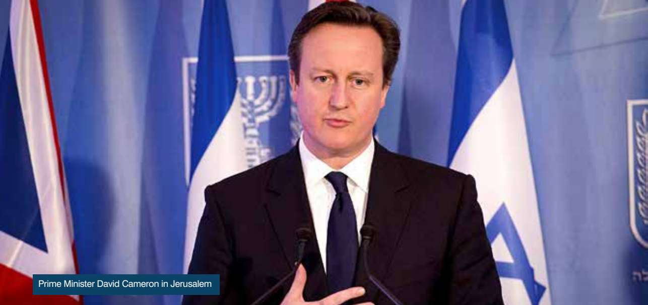
Prime Minister David Cameron in Jerusalem