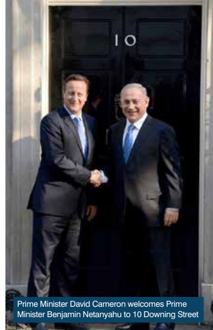
Prime Minister David Cameron welcomes Prime Minister Benjamin Netanyahu to 10 Downing Street

Prime Minister Netanyahu reaffirmed his commitment to restarting peace negotiations with the Palestinians: "I'm willing right now, without any preconditions, any preconditions whatsoever, to sit down with President Abbas and negotiate this peace. I'm willing to go to Ramallah... Anytime. Anywhere. Now. Without preconditions".