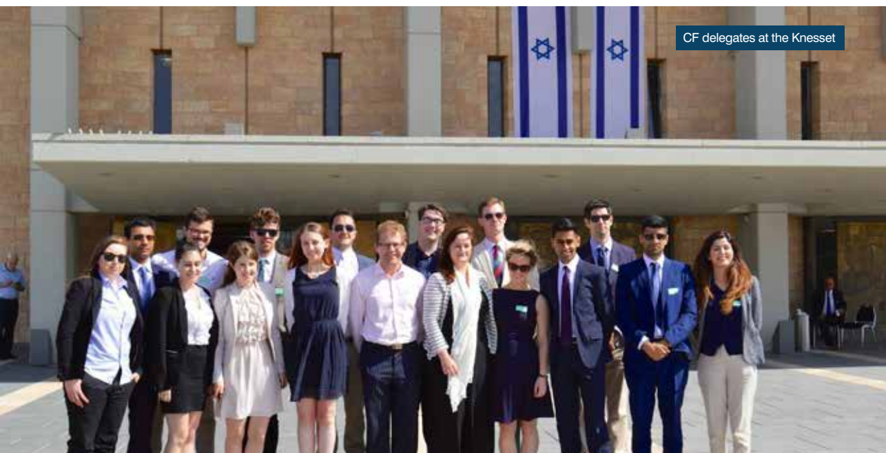
CF delegates at the Knesset

I am delighted that we have been able to provide members of CF with the chance to visit Israel and see the reality for themselves, and I am incredibly grateful to CFI. It is impossible to truly understand either side of the conflict without actually witnessing or experiencing it first-hand. This first CF trip proved highly successful and interesting to the whole group, and I am extremely excited about giving even more CF members this invaluable opportunity.