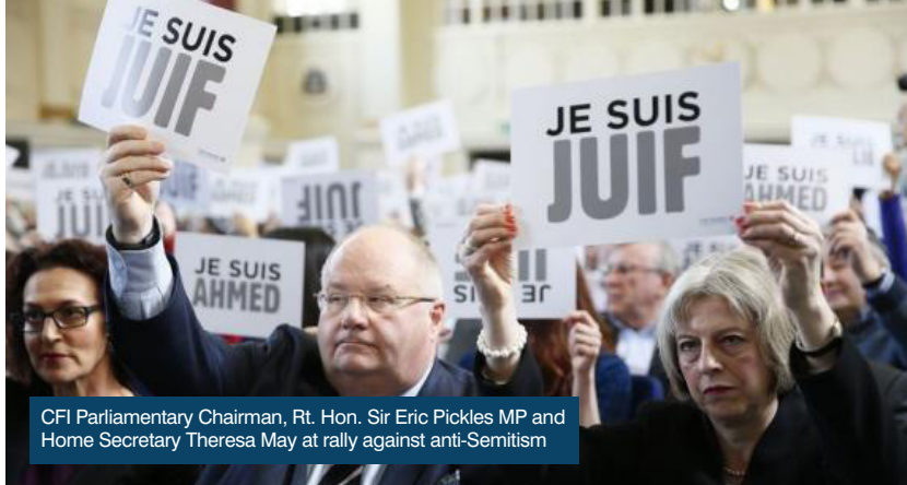
CFI Parliamentary Chairman, Rt. Hon. Sir Eric Pickles MP and Home Secretary Theresa May at rally against anti-Semitism

Conservatives have taken a strong stance against anti-Semitism, vowing not to turn a blind eye to the threats the UK's Jewish community face. In March 2015, Prime Minister David Cameron pledged: "We are going to fight anti-Semitism with everything we have got. There will be no excuses. No exceptions. No justifications". The Government made a series of new