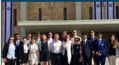
Conservative Future Delegation at the Knesset