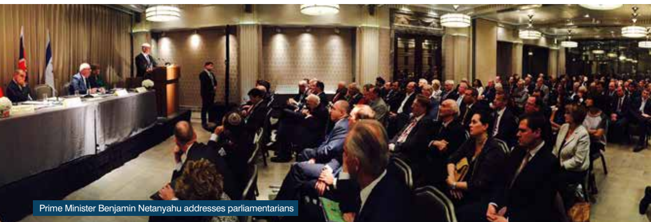
Prime Minister Benjamin Netanyahu addresses parliamentarians

The Israeli Prime Minister's visit to the UK follows the great success of Mr Cameron's landmark visit to Israel in March 2014 where he gave a much-celebrated speech to the Knesset in Jerusalem.