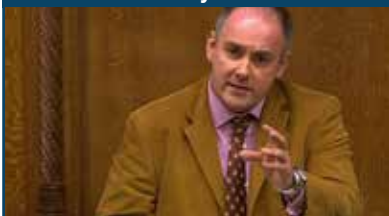
Rt. Hon. Robert Halfon MP in the House of Commons