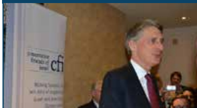
Foreign Secretary Philip Hammond addresses CFI's Conservative Party Conference Reception