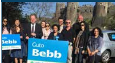
CFI campaigning with Guto Bebb MP in Aberconwy