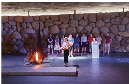
CFI delegation lay a wreath at Yad Vashem Holocaust Memorial