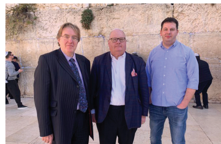
CFI Parliamentary Chairman and Vice-Chairmen at the Western Wall