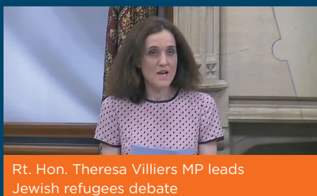
Rt. Hon. Theresa Villiers MP leads Jewish refugees debate

CFI had another busy year in Parliament as we worked with many Conservative parliamentarians to campaign on key issues.