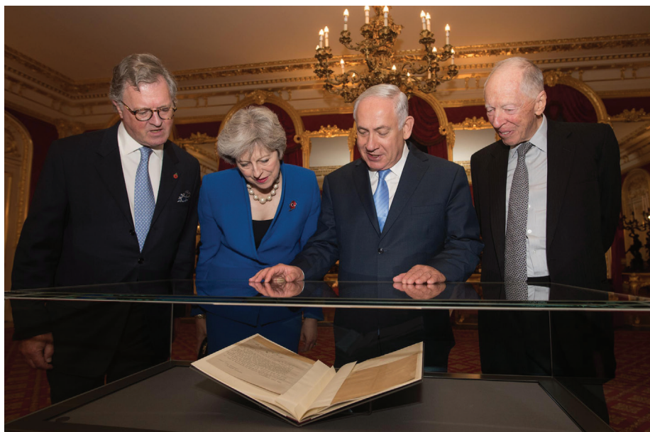
Then-Prime Minister Theresa May and Prime Minister Benjamin Netanyahu celebrate Balfour Declaration centenary

The UK and Israel strengthened cyber security collaboration with the launch of the UK-Israel cyber-physical initiative.