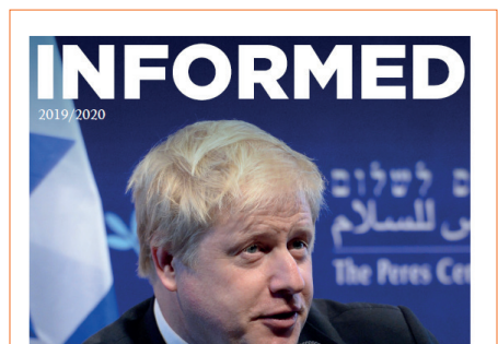
CFI Informed Magazine 2019/20