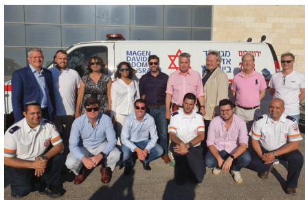
CFI delegates visit Magen David Adom