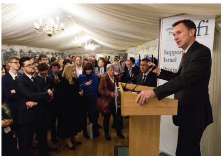
CFI Parliamentary Reception