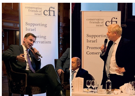
CFI Conservative leadership husting events