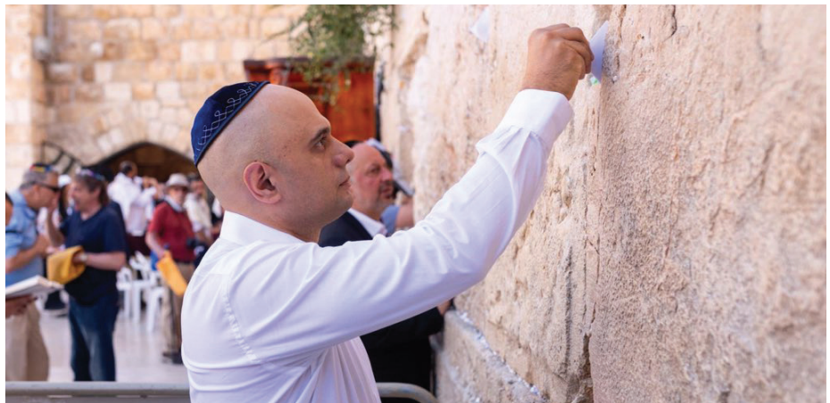
Rt. Hon. Sajid Javid MP at the Western Wall

Chancellor of the Exchequer Sajid Javid visited Jerusalem's Western Wall in July 2019 while Home Secretary, the first by a British Government Minister in almost 20 years. It was part of a three-day visit to Israel and the West Bank, where he met Israeli Prime Minister Benjamin Netanyahu and other senior Israeli and Palestinian political leaders. At CFI's Conference Reception in Manchester in October, Mr Javid reflected on his visit, stating: "It shouldn't have taken two decades, but I know that many more Conservative Cabinet Ministers will follow on from that".